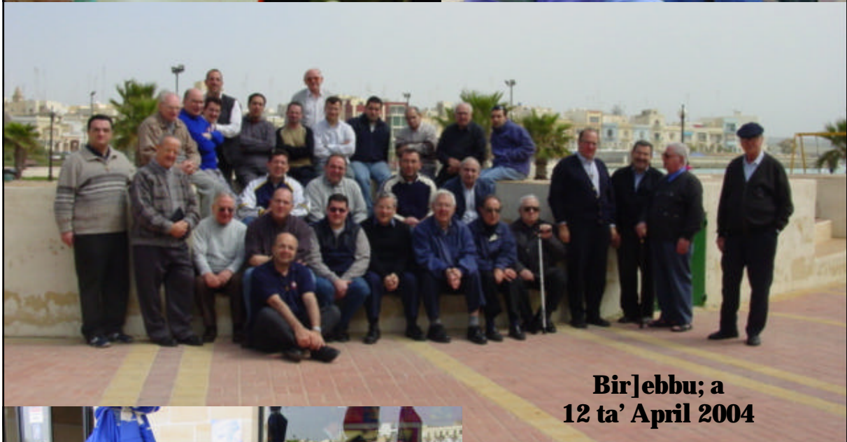
Bir]ebbu; a 12 ta' April 2004